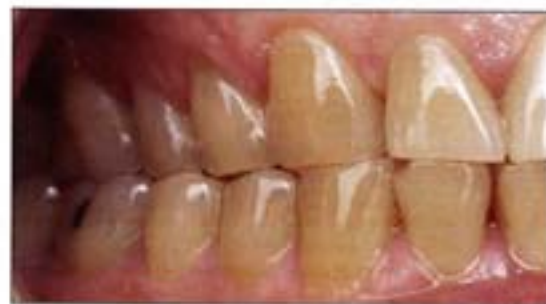
Figure 2. No canine guidance.