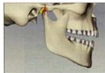
Figure 9. The TMJ position in CR, jaw rotation, translation, as well as maximum intercuspation in harmony with CR are shown in this animation.

The mutually understood treatment plan was thorough-