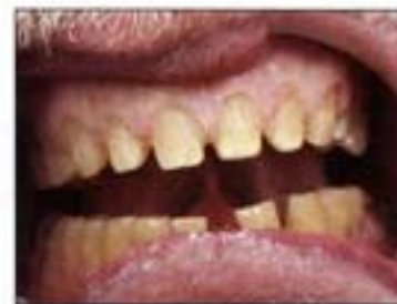
Figure 15. Final preparations of tooth Nos. 5 to 12 prior to impression.