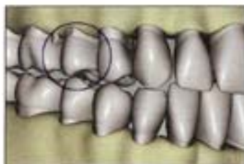
Figure 7. Animation allowed me to wear down the canine cusp tip in real time and focus on the loss of back tooth separation. This shows the contact, movement, and possible abfraction that occurs.