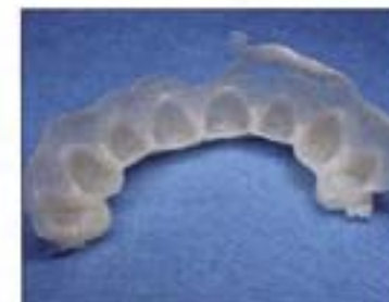
Figure 16. The provisional restorations were successfully removed in one piece from the elastic provisional matrix.