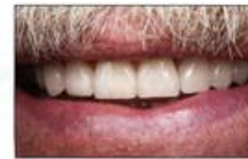
Figure 18. Patient achieved his goals of controlling occlusal disease and having a more pleasing smile.

ly outlined, the cost was discussed, and the patient readily accepted it. The treatment plan included the following: