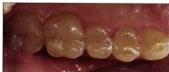
Figure 3. Patient's upper right arch showing severe attrition of cuspid and buccal cusps of all posterior teeth due to lack of anterior guidance. Small points indicate more ideal tooth contacts.

Centric relation position was determined using bimanual manipulation, and the first tooth in contact was in fact the broken and loose molar No. 31. From CR there was a 2-mm forward slide into CO. The large wear facet on tooth No. 31 had its distal origin in CR when evaluated with thin articulating paper. Occlusal examination showed minimal yet sufficient separation of the posterior teeth in protrusive motion. There was group function with balancing interferences during lateral movements bilaterally (Figure 2).