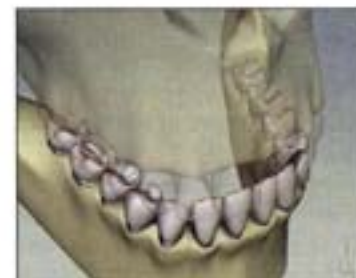
Figure 11. Demonstration of how the dentist's job is to control destructive forces of occlusion. Patients see for themselves the concept of ideal tooth contacts on all teeth hitting evenly and simultaneously.