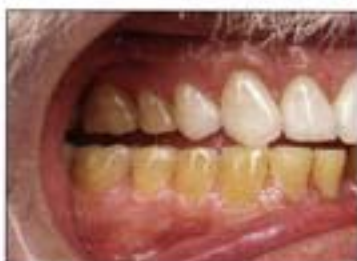
Figure 19. Canine guidance "built in" with final restorations. The patient opted for significant color change knowing tooth whitening and additional veneers were future elective options.