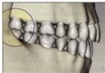
Figure 8. By moving the mandible into CR and back to CO, the patient observed the impact on the most distal tooth in contact. Tooth movement causing open contacts, looseness, and reasons for fracture or sensitivity is demonstrated here.

the buccal cusp tips of all maxillary posterior teeth displayed wear facets into dentin (Figure 3). The maxillary first and second premolars had class 2 mobility, and there was pronounced recession on the facial surface of the first premolars.