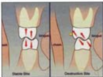
Figure 4. Animation showing how proper tooth contacts are pinpoint on molars and directed toward the long axis of the roots versus contacts on inclines that move, wear, or fracture teeth.