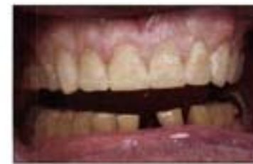
Figure 13. The teeth shown here were presented to the patient for his approval. They were then polished and ready for a "test drive."