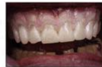
Figure 17. Provisionals in the mouth prior to trimming, cementing, polishing, and repairing defects with LuxaFlow.