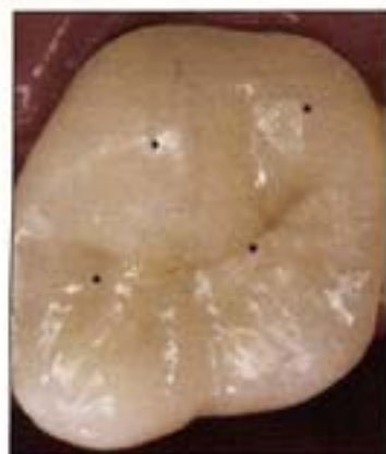
Figure 5. Demonstrating how minimal the areas of contact are ideally.