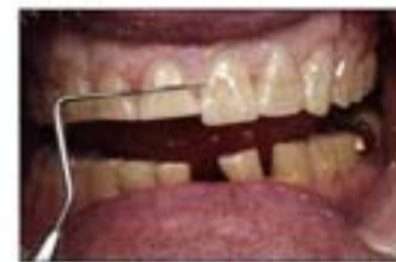
Figure 12. Patient shown by 3-D mock-up on maxillary left side that the golden proportions for tooth size look like. Knowing the original tooth width allowed the author to restore to ideal length.