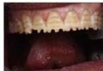
Figure 14. The mocked-up teeth are prepared to minimal guidelines for ceramic veneers. There was no need to reduce incisal enamel, as that was removed by years of uncontrolled occlusal disease.